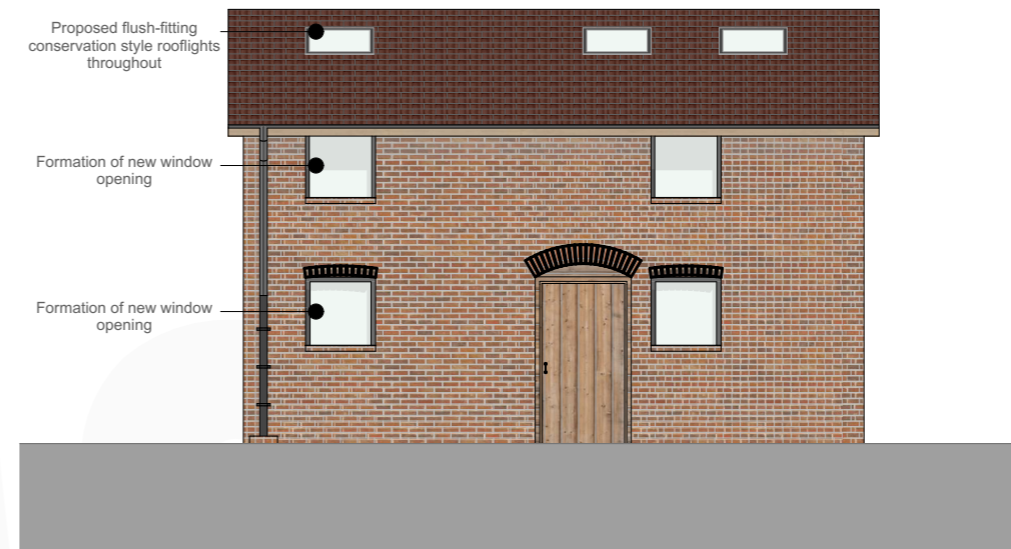
E2 Proposed Side Elevation 1:100