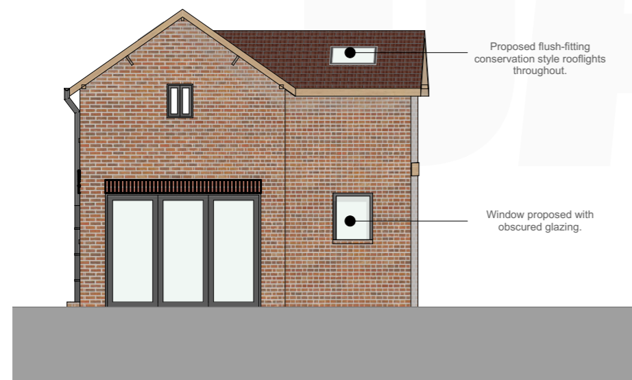
E3 Proposed Rear Elevation 1:100