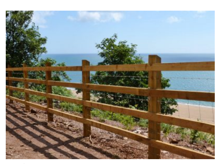
1.2m high timber post and rail fence to swales and drainage pond