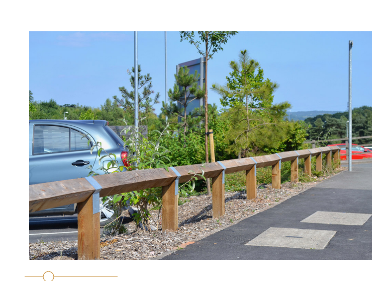
timber knee rail fence to car park