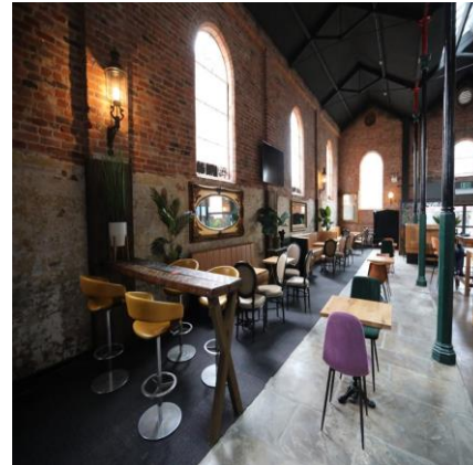
Society Market Newport