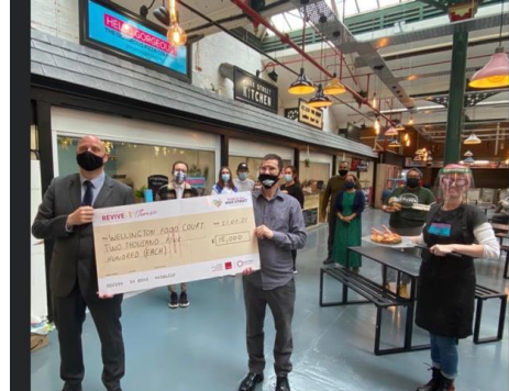
Wellington Market Food Court