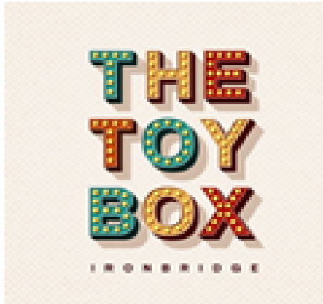
The Toy Box Ironbridge