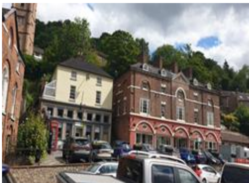
The Square, Ironbridge