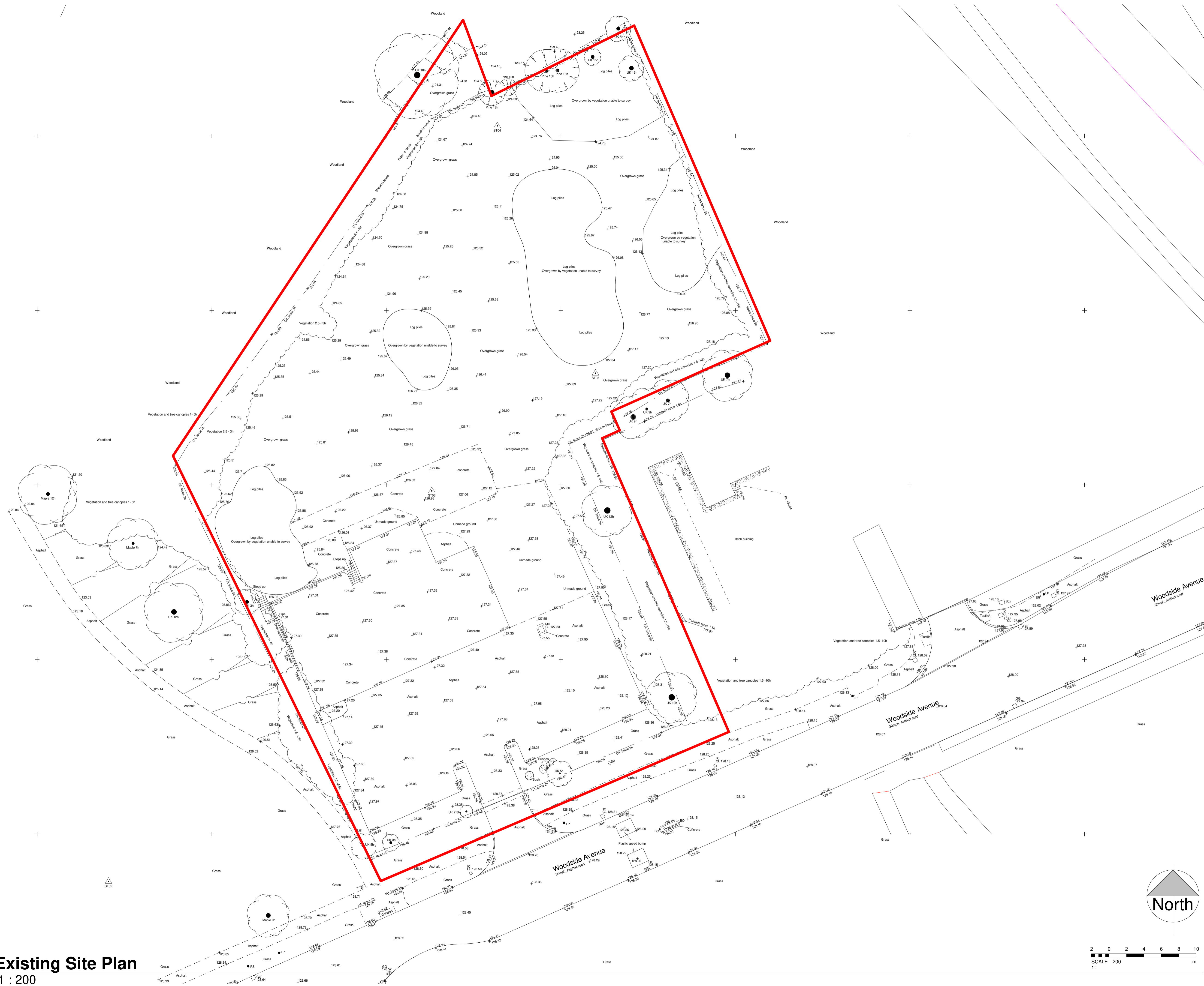
Existing Site Plan 1 : 200

Architects are to be notified of any discrepancies. Contractors must check all dimensions on site. This drawing is subject to copyright laws and is for use on this project only. This drawing is to be used solely for the information as titled only. For other information refer to the latest revision of any cross referenced drawings. To be read in conjunction with relevant design standards/protocols