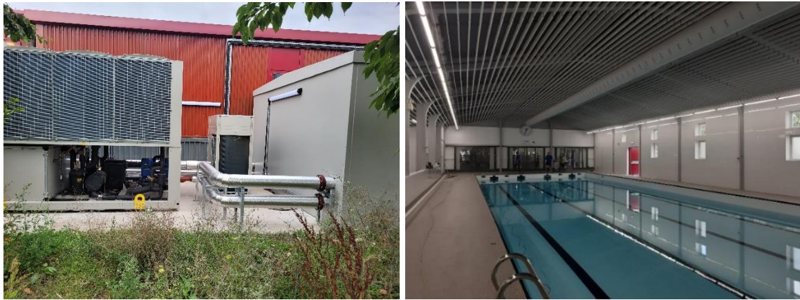
Air source heat pump and completed installation at Newport Leisure Centre