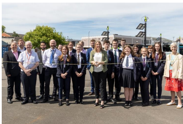
Opening of Wellington Bus Station