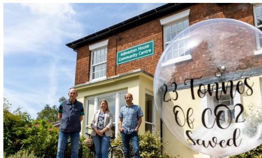
Admaston House Community Centre one of the recipients of the Climate Change Fund.

The fund was launched in February 2021 with a £100k grant fund to support local groups and small businesses with projects to reduce their carbon footprint and help the Borough reach Net Carbon Zero by 2030. It was very well received, with the scheme being oversubscribed, receiving 69 applications with grant requests totalling over £250,000.