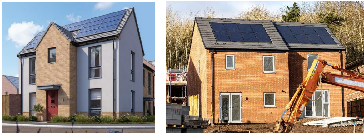
Sustainable housing at Southwater Way