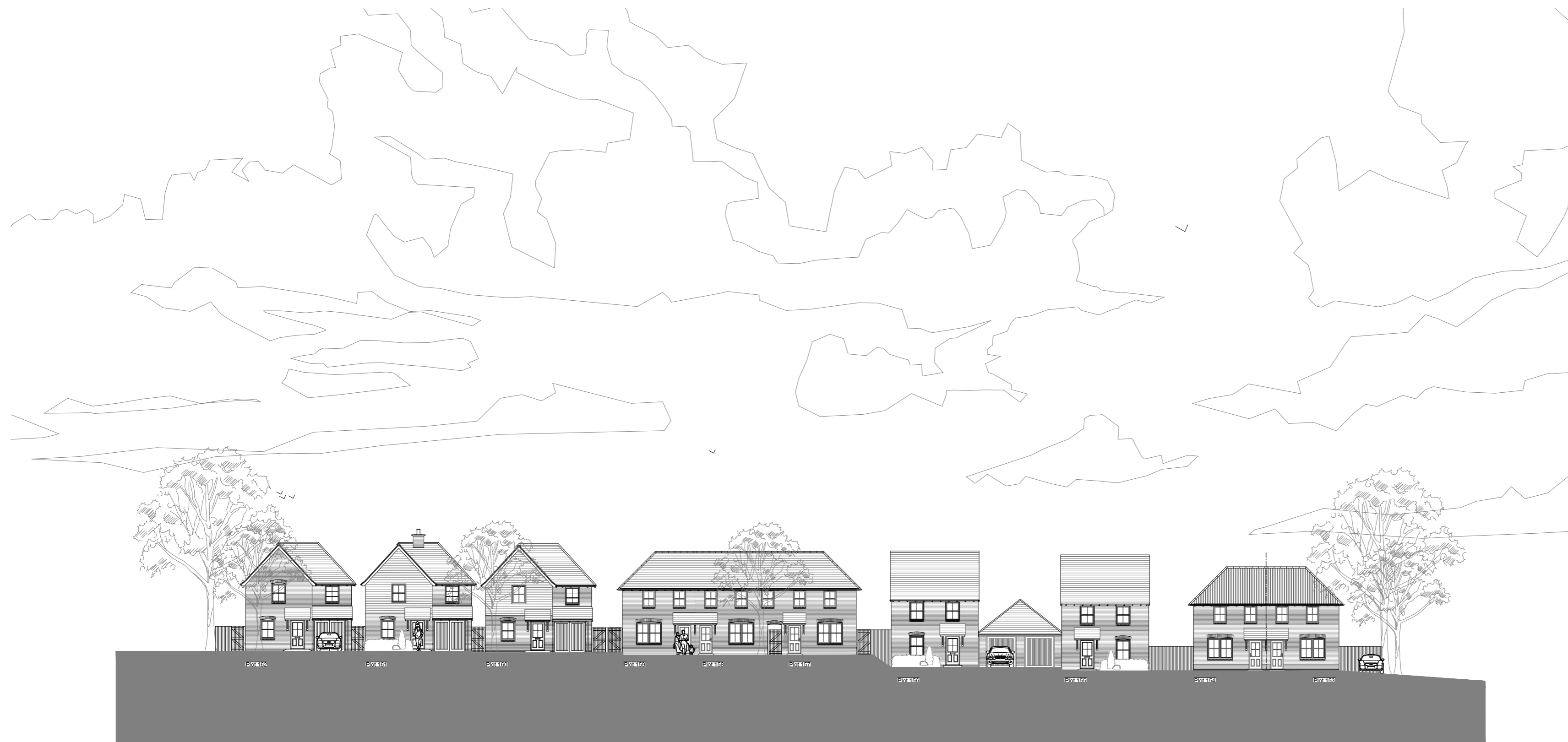
Street Scene A-A