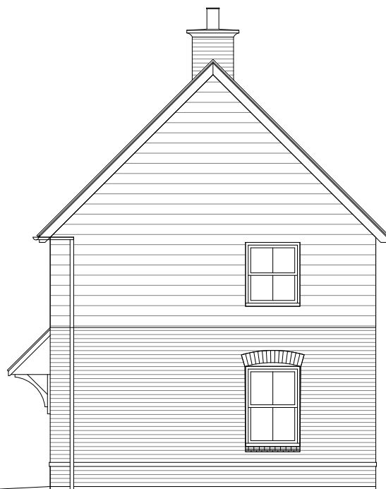
FRONT ELEVATION 2